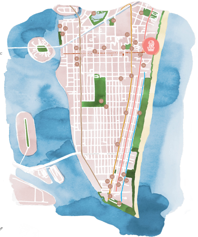
The Ritz-Carlton Residences, South Beach